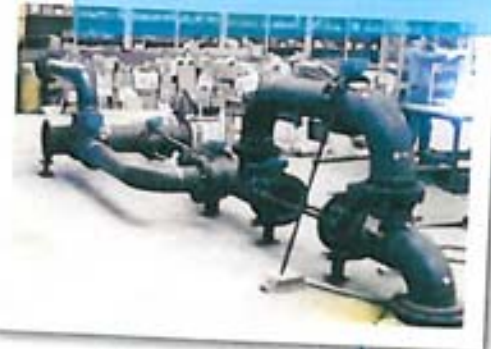
Shop fabrication for Ford Motor Company