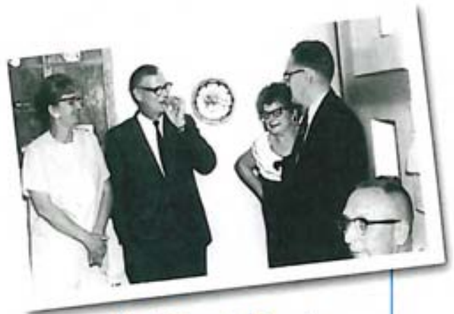
Early Board of Directors Meeting 1955