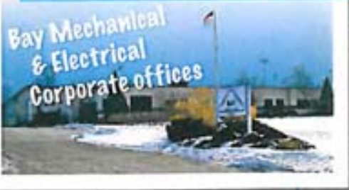
Bay Mechanical & Electrical Corporate offices

in Construction" and exceptional opportunities for all members of our team "