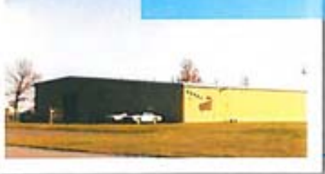
Estimating room early 70's