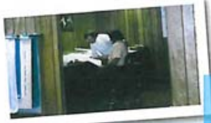
New Corporate Offices early 70's